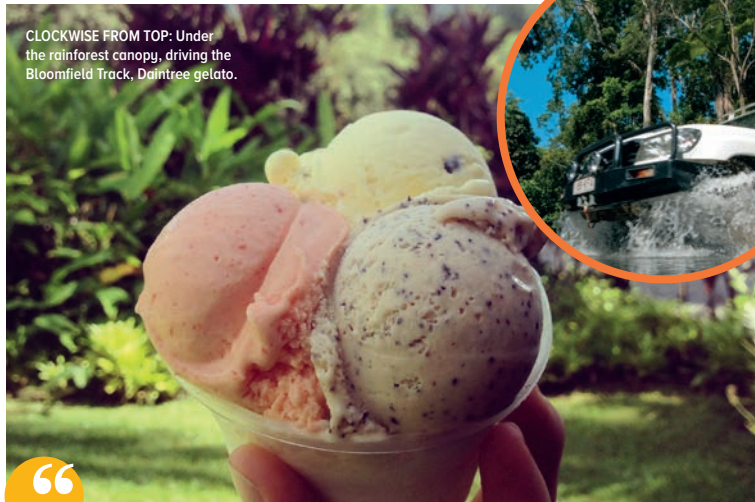
CLOCKWISE FROM TOP: Under the rainforest canopy, driving the Bloomfield Track, Daintree gelato.

They don't move around that often but when it's wet they hunt for food. We've seen more and more cassowaries here but they are just like everyone else. They are generally not grumpy but they are wild animals who can turn as soon as they feel threatened."