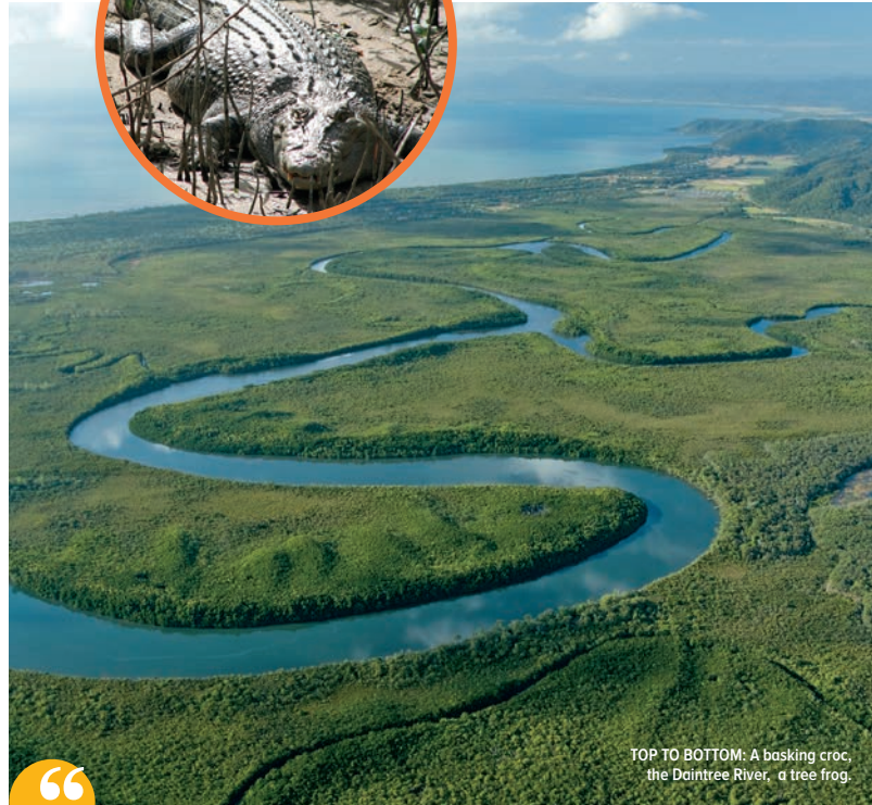
TOP TO BOTTOM: A basking croc, the Daintree River, a tree frog.